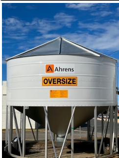
Ahrens Combi Bins (For Grain & Fert) in stock now